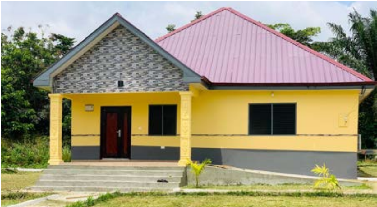
Maternity Block at Aperade