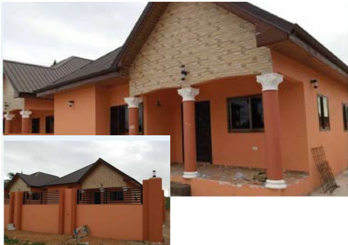
3Bedroom Residential Building at Kasoa