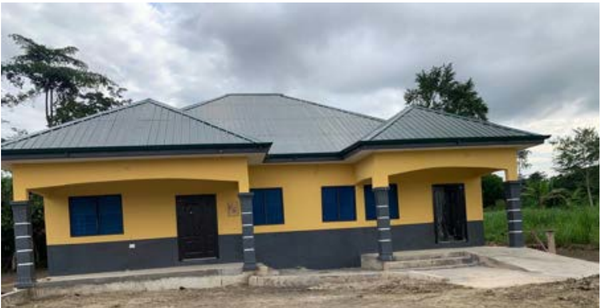
Chip Compound at Siawkrom