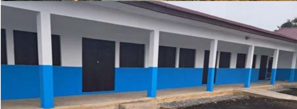
6 Classroom Block at Anamase