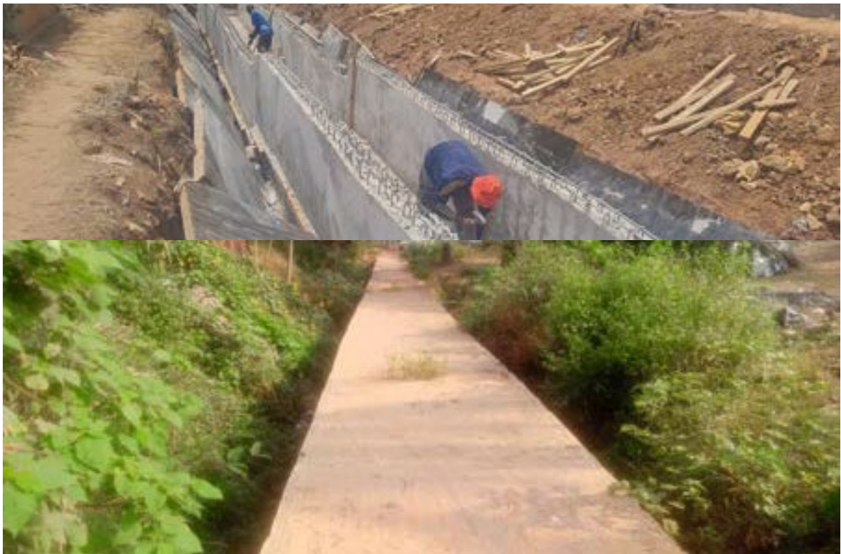
Storm Drain Work at Bohyen Kumasi