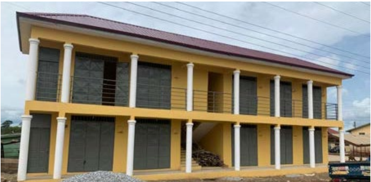
12 Unit Lockable Stores at Akim Bient