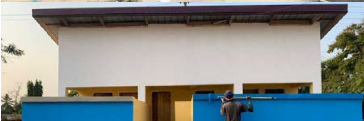
6 Classroom block with Toilet Facility at Oda