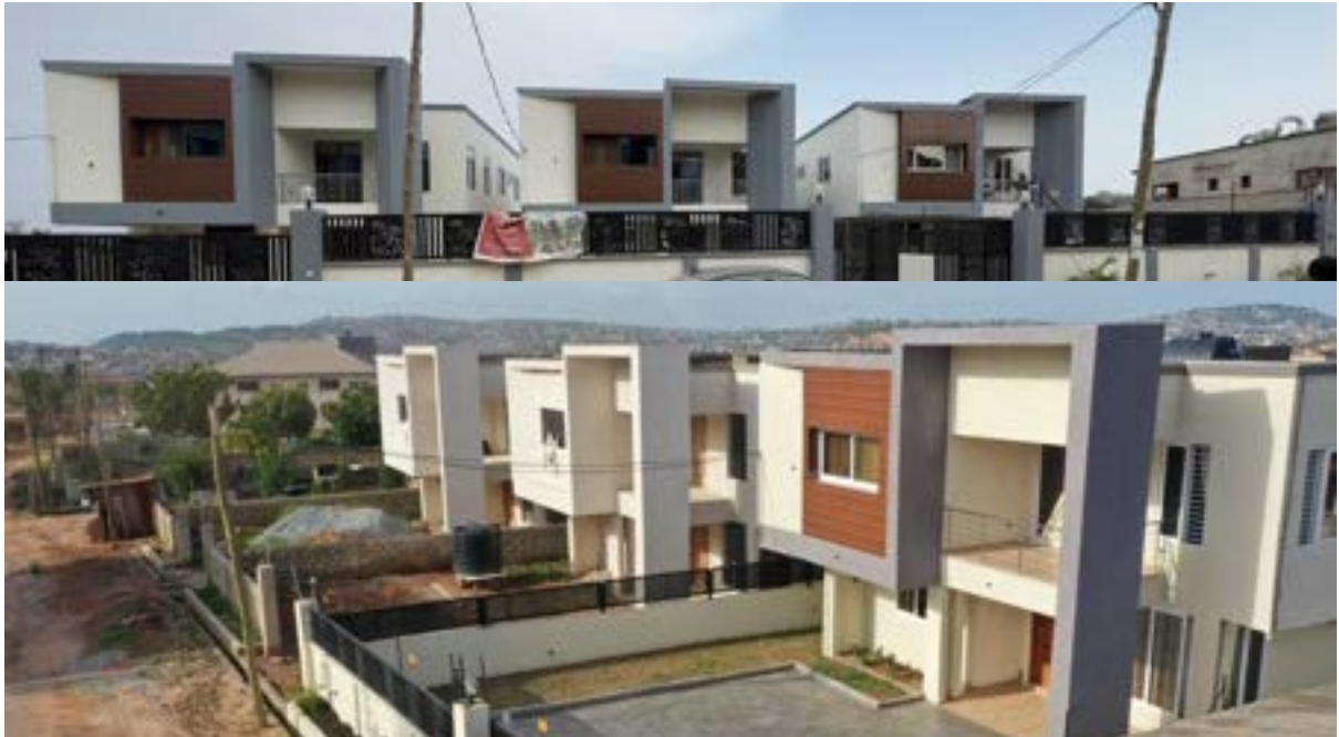
3 Unit 4 Bedroom Residential Building at West Hills